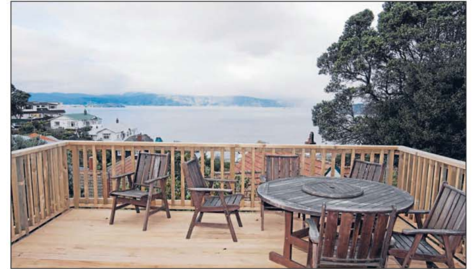
Look out: The biggest changes were made in the living areas, where the original lounge has been turned into a formal dining room that now adjoins a newly built formal lounge with a harbour view and private balcony.